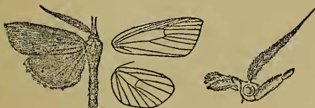
Plumipalpia lignicolor , ♂ \frac{1}{2} .

Palpi obliquely upturned, the second and third joints fringed with